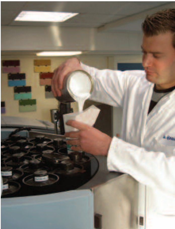
Colorants are loaded in dispenser with paper funnel, that's certainly not a filter.