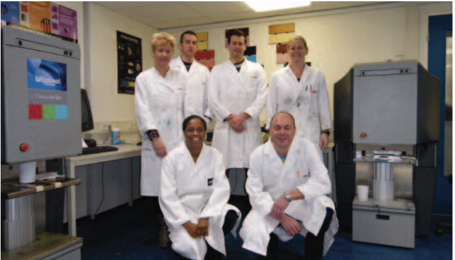
Six person Wijzonol Color Team provides formulas for retailers worldwide.

I found it very interesting that quality control at Wijzonol extends to the human element. All applicants for positions in the color matching lab are required to undergo a thorough eye examination before interviewing for a position.