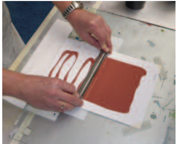
Drawdown bar is used to create film of uniform density prior to color evaluation.